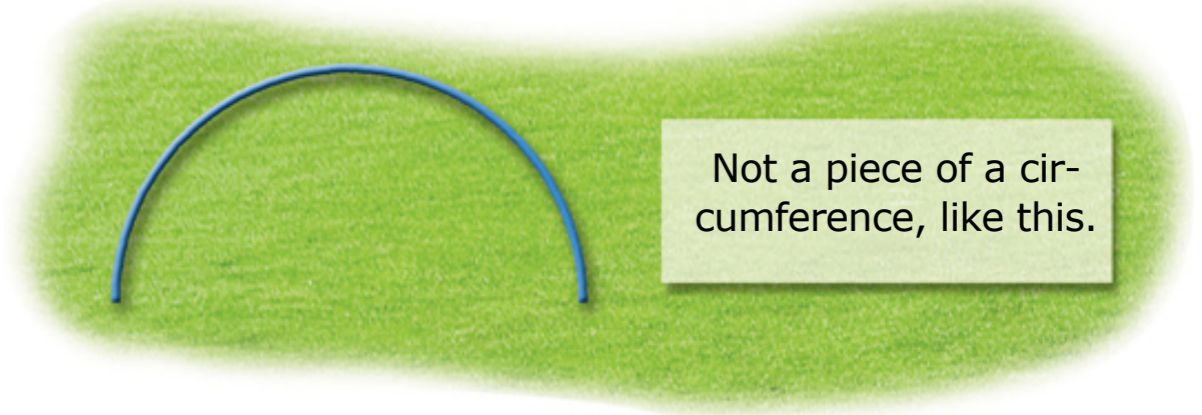
• Fig. 3.27